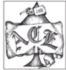
Angstead Custom Engineering